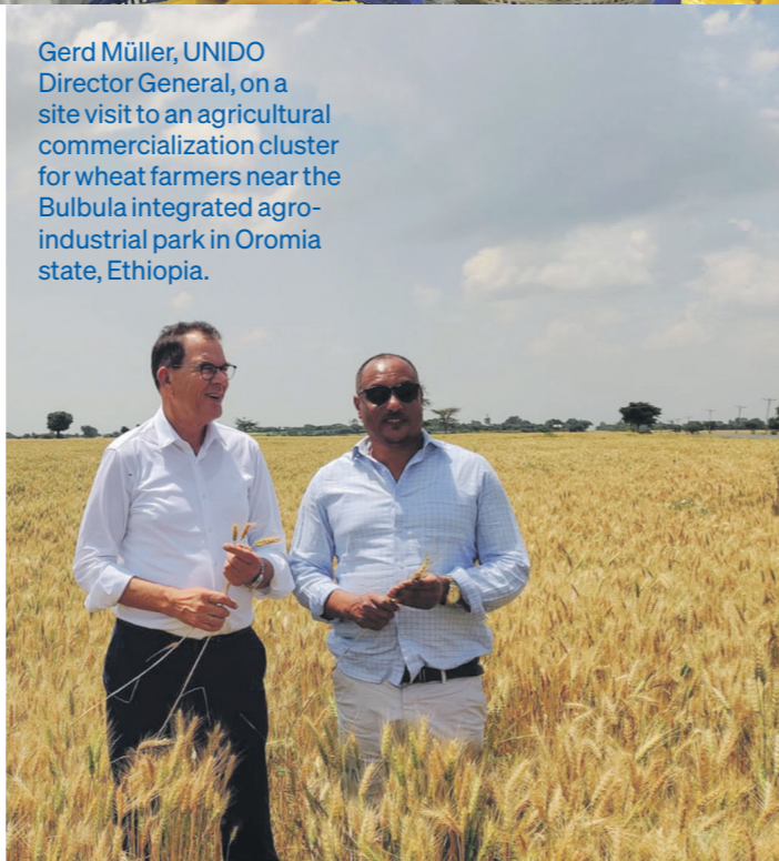
Gerd Müller, UNIDO Director General, on a site visit to an agricultural commercialization cluster for wheat farmers near the Bulbula integrated agro-industrial park in Oromia state, Ethiopia.

parks, which has led to double the wheat harvest per hectare over three years. Three agro-food parks are under development in Senegal and others are in the design stage in Kenya, Tanzania and Zambia, amongst others.