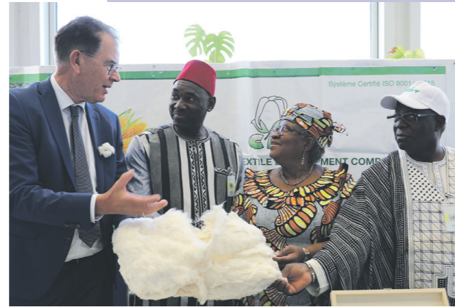
UNIDO Director General Gerd Müller (first from left) with WTO Director General Ngozi Okonjo-Iweala (third from left)