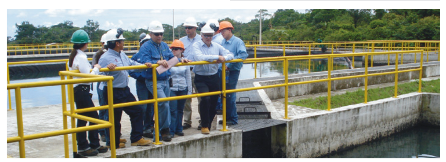
Site visit at Ecopetrol S.A. in Colombia which adopted Chemical Leasing together with its chemical supplier Nalco de Colombia Ltda., in 2008

For Ecolab the profit margin for its dry lubricant is 10 per cent higher, even though the company sells less lubricant per production line, and has costs for the service. Ecolab is now the sole lubricant supplier of Knjaz Miloš. The partners have already adopted Chemical Leasing for two more lines and plan to extend the model to all packaging lines. Due to the success of the partnership, both companies were honoured with a Gold for their project at the Global Chemical Leasing Award in June 2012.