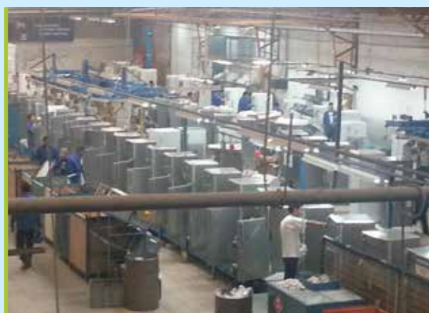
HCFC phase-out project development at a large domestic refrigerators manufacturing enterprise in Ecuador