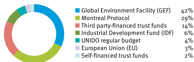
UNIDO's project funding sources 2013-2014

Source: UNIDO Annual Reports 2013 - 2014