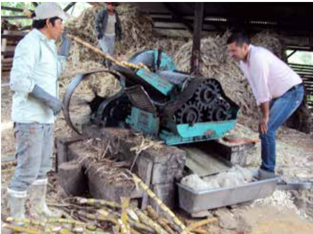
Colombian expert assessing Ecuadorian small processors of sugar cane through cooperation supported by UNIDO IKB project in August 2013.