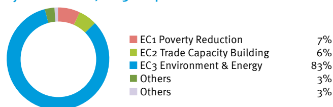
UNIDO technical cooperation implementation percentages by thematic area; 2013-2014.

Source: UNIDO Annual Reports 2013 and 2014