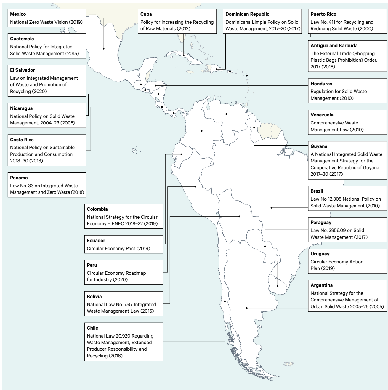
Map 1. Summary of key circular economy policy measures

as infrastructure development. Furthermore, to enable just transitions, policies and legislation relating to labour rights are fundamental to inclusive circular economy structures. For example, in 2019, Mexico updated its Federal Labour Law, which has removed barriers for workers wishing to access the justice system. 76