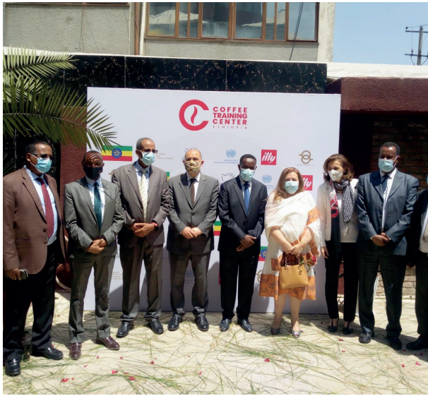
COFFEE TRAINING CENTER