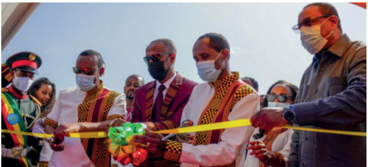
Inauguration of the Yirgalem Integrated Agro-Industrial Park by Ethiopia’s Prime Minister Abiy Ahmed in March 2021. See the press release page: https://www.unido.org/news/prime-minister-abiy-ahmed-inaugurates-yirgalem-integrated-agro-industrial-park-sidama-state-ethiopia