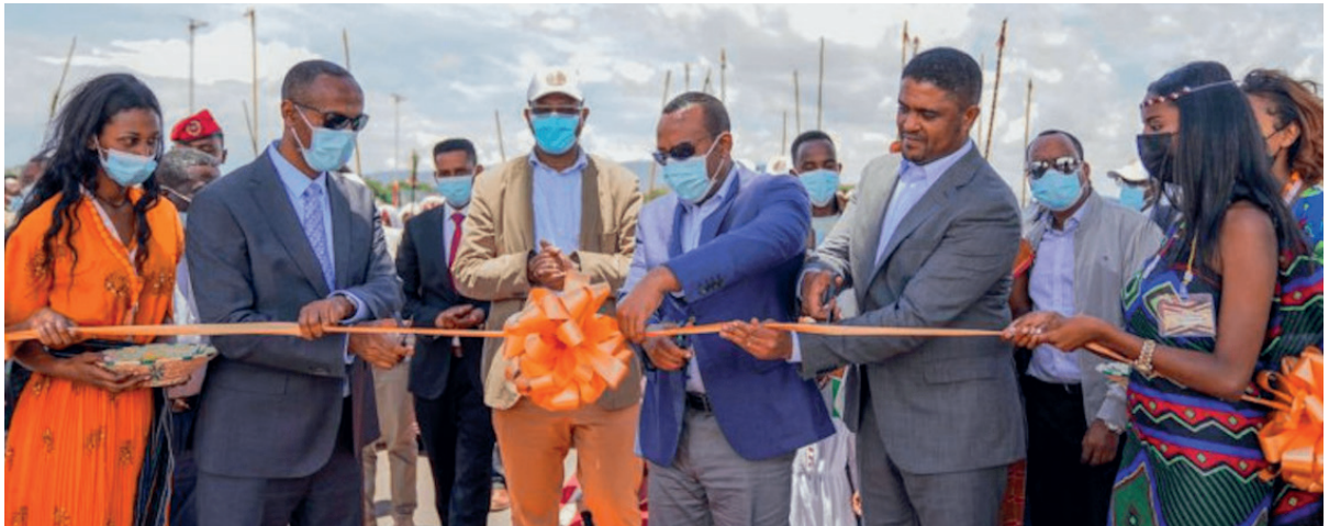
Inauguration of the Yirgalem Integrated Agro-Industrial Park by Ethiopia’s Prime Minister Abiy Ahmed in May 2021. See the press release page: https://www.unido.org/news/ethiopias-prime-minister-abiy-ahmed-inaugurates-third-integrated-agro-industrial-park