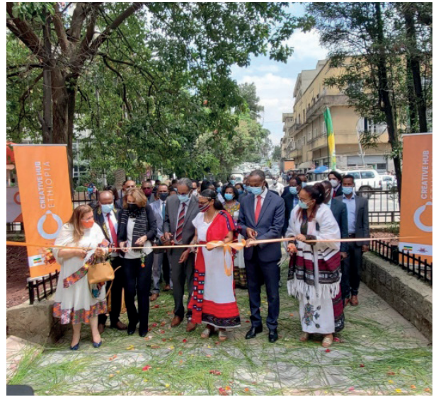
CREATIVE HUB INAUGURATION