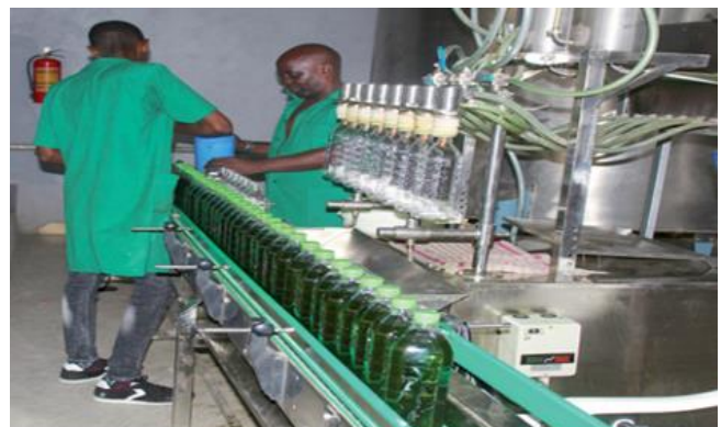
Ethanol bottles ready for distribution.