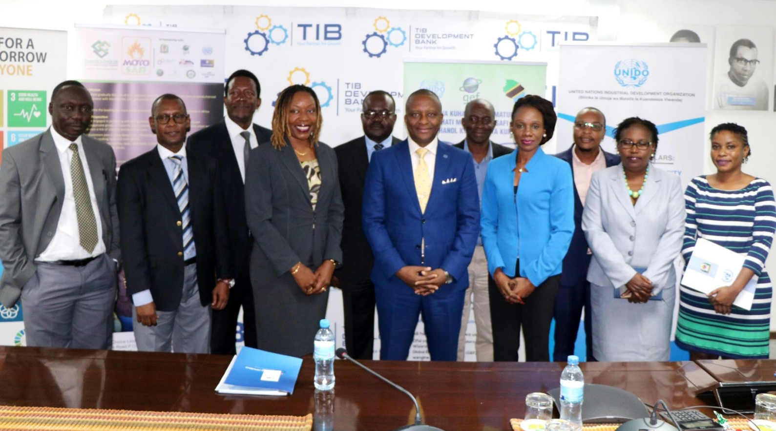
Launch of the bioethanol programme in Dar es Salaam, Tanzania