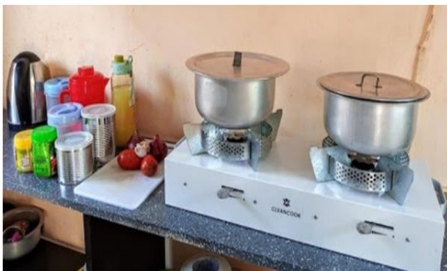
Twin burners cook stove in Tanzania.