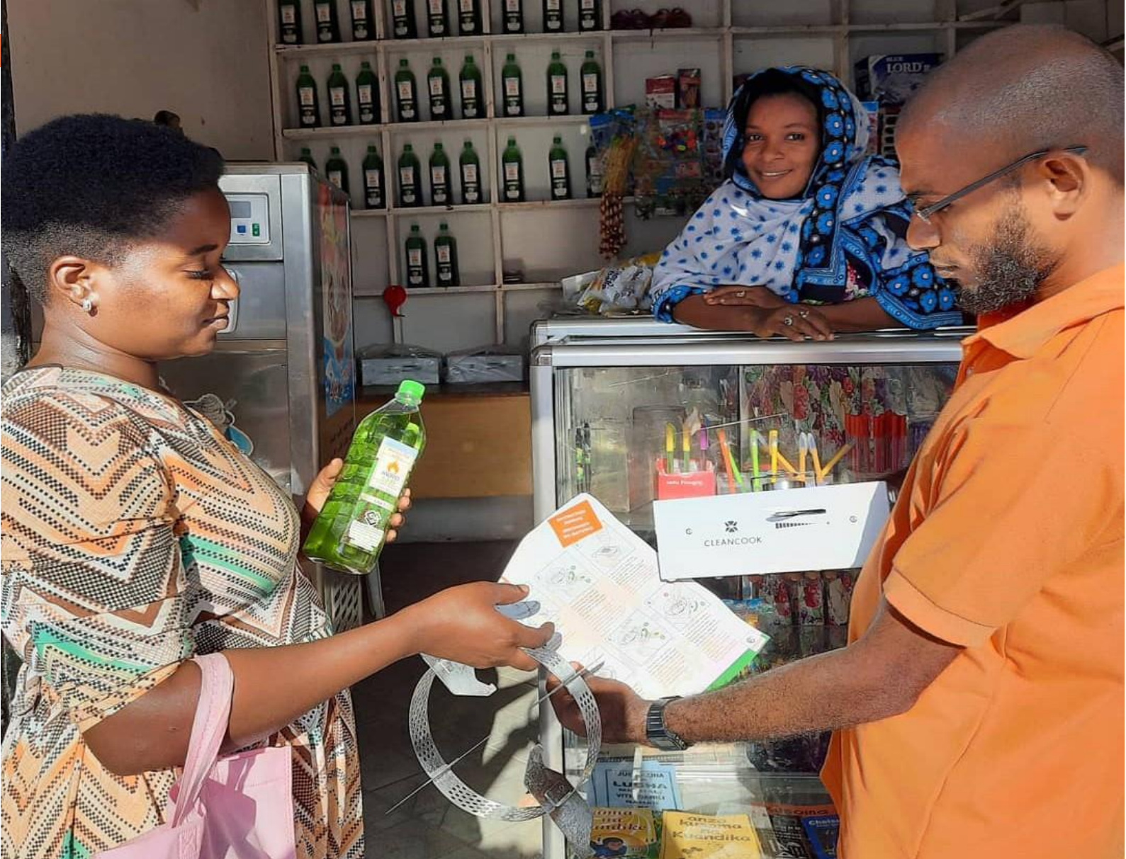
Retail outlet, Dares Salaam