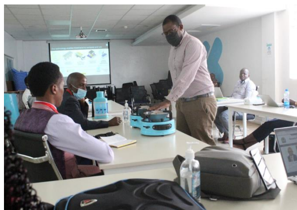
Ethanol cook stove demonstration to the TBS colleagues from KIRDI.

The main purpose of the visit was to gain insight on the KEBS experience in developing standards for ethanol cookstoves and ethanol fuel. Also, for gaining more knowledge on the performance and sustainability of the existing standards, as well as learning from manufacturers and consumers on product feedback (ethanol cookstoves and ethanol fuel) and identification of opportunities for harmonization of standards within the region.