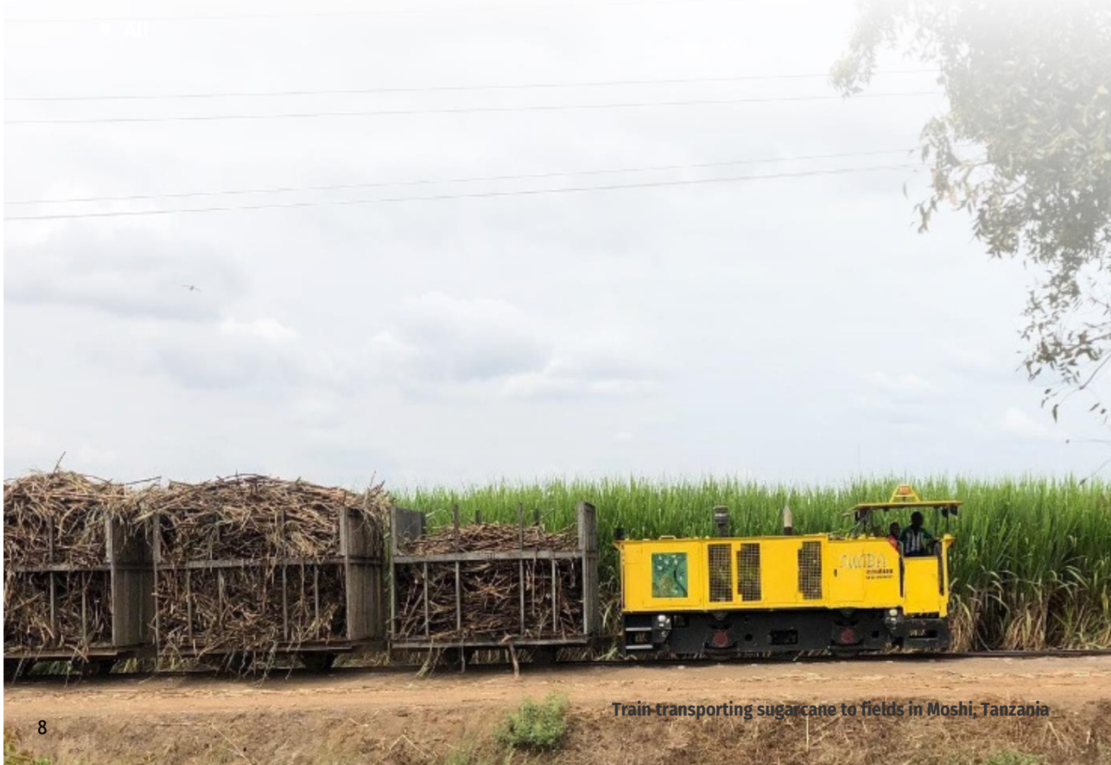
Train transporting sugarcane to fields in Moshi, Tanzania