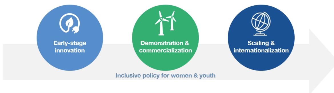
Figure 1: The most effective set of policies differs according to stage of innovation 2

Successful countries design and deploy targeted interventions to achieve innovation priorities and wider targets. They also design and implement support mechanisms which work to incentivize private investment in innovation. The most effective set of policies differs according to the stage of innovation countries wish to prioritize. Early-stage innovation covers the lab to prototype stage, or the earliest stages of company formation. Mid-stage innovation includes the demonstration and first commercialization stages, while later-stage innovation includes scaling and internationalization.