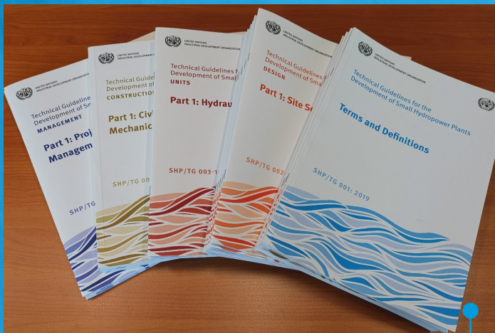
Small Hydropower Technical Guidelines booklets

It is expected that international experts from stakeholder organisations will be invited to provide input for the project. There will be several international peer reviews to set the path for the development of the technical guidelines, furthermore, for an international standard development for SHP.