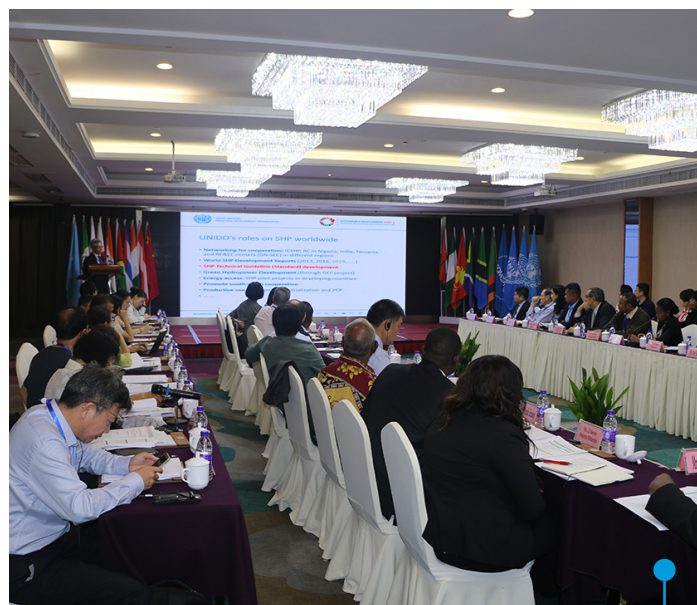
IWA Workshop held in June 2019 in Hangzhou, China

This project stresses the importance of establishing a common framework for SHP planning, construction and operation worldwide which will borrow and compile best practices from existing SHP standards, allowing a more consistent development of the technology.