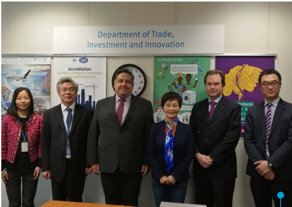
ICSHP team visiting UNIDO HQ in Jan. 2018

The project aims to develop a small hydropower (SHP) technical guideline which will serve as basis for the development of international standards for SHP development. The project will be part of UNIDO effort with the strategic partner at helping developing countries in the application of clean energies. Funded by the Government of China, the project promotes creating job opportunities through sustainable industrialization.