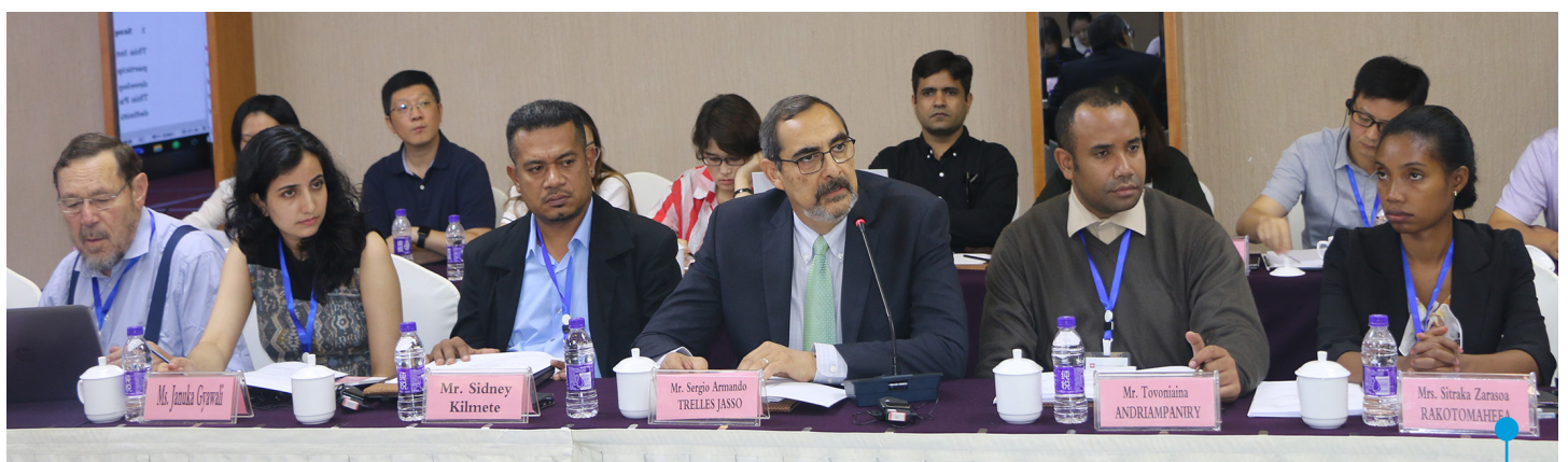
IWA Workshop held in June 2019 in Hangzhou, China

Guidelines provide guidelines for basic requirements, methodology and procedure in terms of site selection, hydrology, geology, project layout, configurations, energy calculations, hydraulics, electromechanical equipment selection, construction, project cost estimates, economic appraisal, financing, social and environmental assessments—with the ultimate goal of achieving the best design solutions.