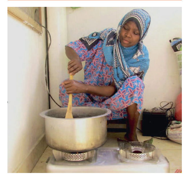
Zanzibar, woman cooking using the Cleancook stove.