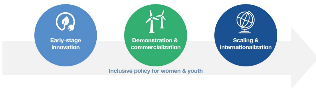
Figure 1: The most effective set of policies differs according to stage of innovation 2

Countries that are successful globally in cleantech innovation share common strategies which have contributed to that success. Similarly, countries that have successfully increased the participation of women and youth in cleantech entrepreneurship have also adopted common strategies. GCIP partner countries can leverage these policy strategies to strengthen their domestic capacity for cleantech innovation and to increase the participation of women and youth in domestic cleantech startups and micro, small and medium-sized enterprises (MSMEs).